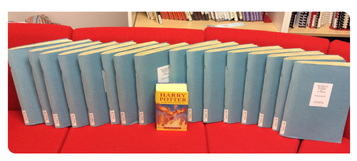
When transcribed into braille, Harry Potter and the Order of the Phoenix fills 16 braille volumes – more than 1500 pages of braille!